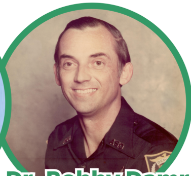
Dr. Bobby Damron Legacy Scholarship

The fund supports legacy scholarships to help Alachua youth elevate their leadership development and find their sparks through state and national 4-H opportunities .