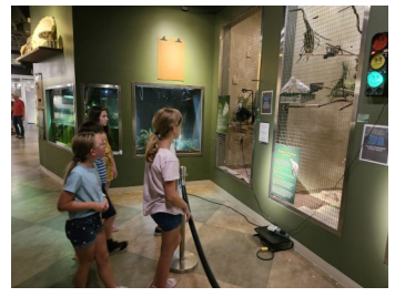
UF Space Plants Lab