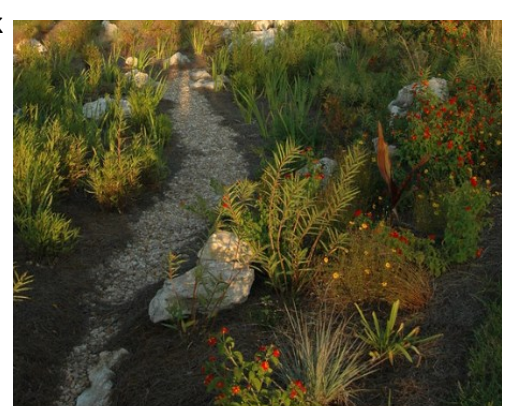
Rain garden on the University of Florida campus.

Rain gardens work best when they're placed near downspouts or naturally low spots in the landscape. They are especially useful for collecting runoff from paved surfaces, and berms can be