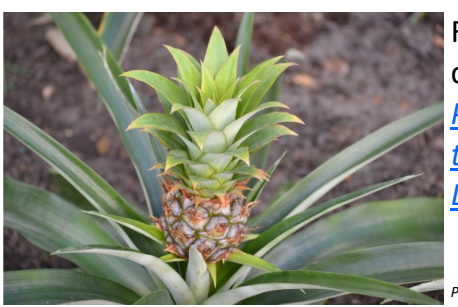
For more info, check out: Pineapple Growing in the Florida Home Landscape

Harvest: Harvest when the bottom of the fruit starts to change from green to yellow.