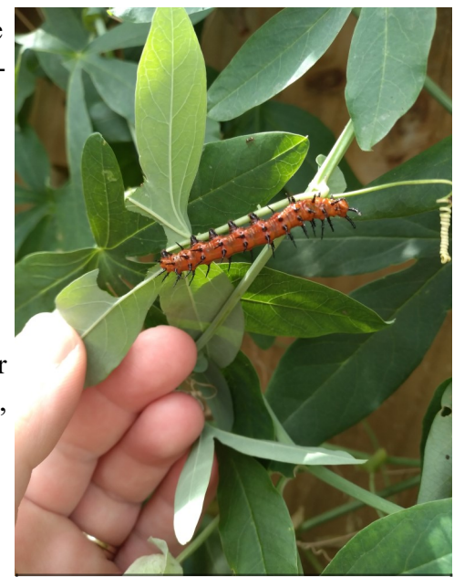
Gulf Fritillary larvae

One of the first premises of gardening for wildlife is that you should use vertical layering. Vertical layering just means that you design your landscape for different heights and layers of plants. You would have a tree layer, a shrub layer, maybe a layer of perennials and a layer of groundcovers. Different butterfly species can use plants that fit in all these layers. The common yaupon holly is a host plant for the Henry's elfin. This little brown butterfly may not be the queen of the garden, but still adds to the diversity of your yard. For the perennial layer, everyone knows that milkweed is the host for monarchs. But, did you know that plumbago, which is readily available at any garden center, is the host for the cassius blue, a small but beautiful insect? In the shortest plant layers, you can introduce the native twinflower ( Dyschoriste oblongifolia ), which only gets a foot tall and has light purple flowers, borne in pairs. Or, how about turkey tangle frog fruit (Phyla nodiflora), a tiny groundcover of a plant that is most notably used as a turf alternative. Both groundcovers host the buckeye, which is a medium sized butterfly with brown, orange, and cream wings with a distinctive eye spot pattern.