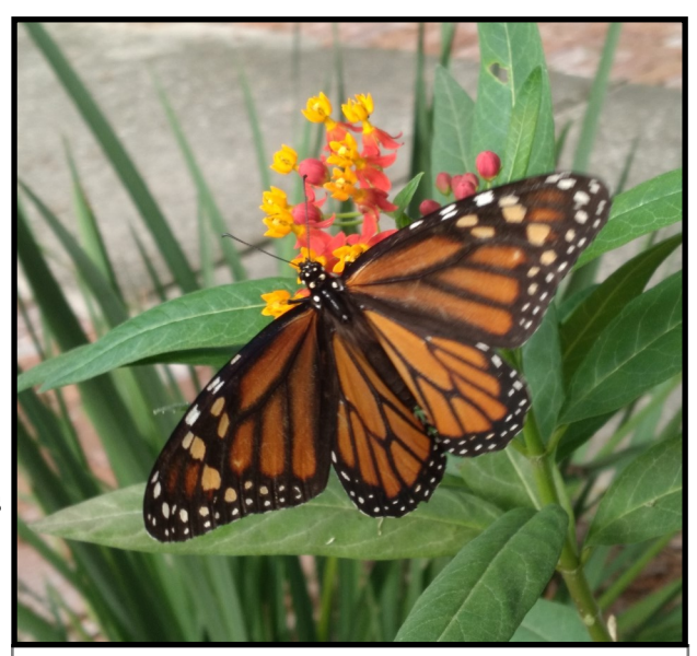
Monarch on Milkweed

Planting for a specific butterfly is exactly what my husband, Daniel, did this weekend. When we moved to Florida, we were gifted a beautiful non-native passionflower, Passiflora