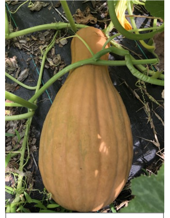
Seminole pumpkins are typically tolerant of summer conditions.

Some warm season crops are much happier here in the spring. By the time our intense summer heat hits, they become unproductive and become magnets for insects and disease. Examples are most large slicing tomatoes, some bell peppers, yellow and zucchini squash, many greens, cucumbers and beans. Others, like corn or determinate tomatoes, may be finished producing. Harvest as much as possible by the 4th of July or so and pull up plants as they decline. By doing so you may avoid disease and insect problems that could linger for many seasons.