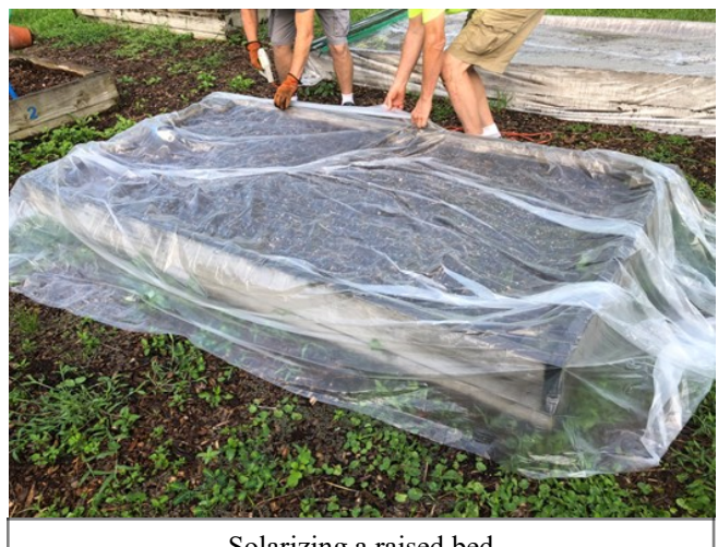
Solarizing a raised bed

If you do pull up spring crops, take a day to get your beds ready for the next season before you go inside or on vacation. Weed, add bed mix and organic matter and replace otting boards if needed. Remove irrigation lines and emitters. Then go the extra mile and cover your bed tightly with clear plastic to solarize the soil. Solarizing uses the heat of the summer sun to kill weed seeds and pathogens in the top few inches of soil. When you're ready to plant in the fall, remove the plastic and plant without disturbing the soil.