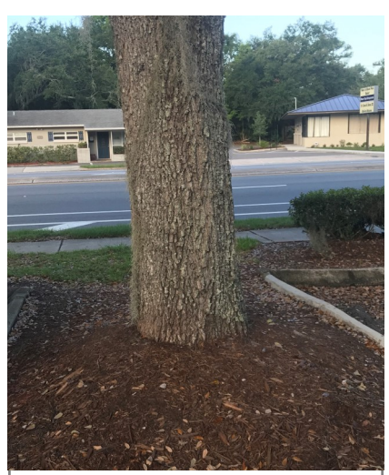
Root Flare Buried

part of the root system that bears most of the load in holding the tree up is the root flare. If you picture the tree as a wine glass, the root flare is the base of the wine glass. Many trees have had their root flares covered by soil during construction or landscape activities. Mulch volcanoes are formed when mulch is piled over the root flare and against the trunk of the tree. Both situations are bad for the tree because it buries the roots and promotes disease and makes inspection of the root flare difficult. Any damage to the root flare by construction, or other means, is a cause for alarm. Recall the wine glass analogy and imagine how unstable the wine glass would be if part of the base were gone. Finally, the last step in inspecting the roots is to step back away from the tree and look at the uppermost branches of the tree. If they are bare, or not as full as the rest of the tree crown, it may indicate root problems. A Certified Arborist should be called in to inspect the tree if any problems with the root system are suspected.