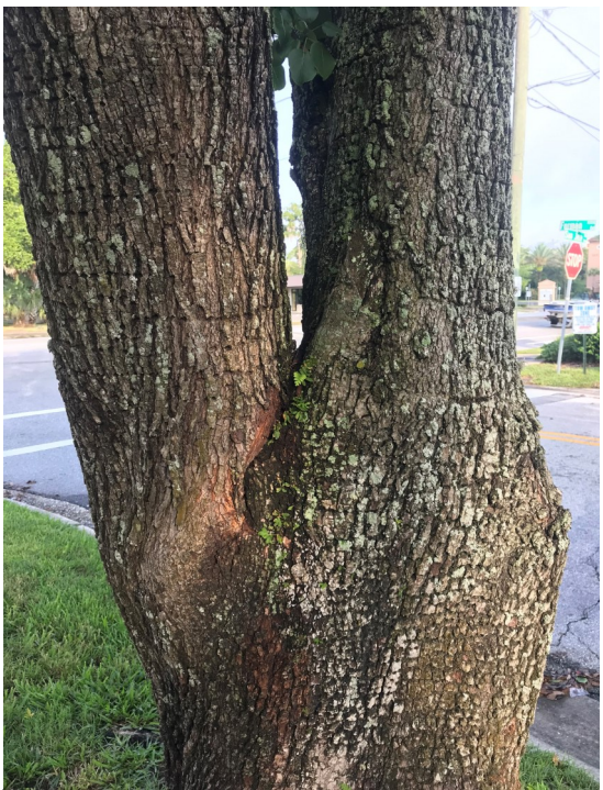
Included bark means a weak attachment

I often hear that trees should be thinned out so that wind blows through them. This assumption was proven wrong by research from the University of Florida that showed properly pruned trees had considerably less damage than unpruned and improperly pruned trees. Improper pruning by over lifting the crown through the removal of large lower limbs and thinning out interior branches resulted in more damage to the tree during windstorms. Properly pruning trees by using reduction cuts and structural pruning resulted in trees that resisted wind and therefore received less damage.