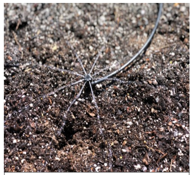
Inspect and repair irrigation