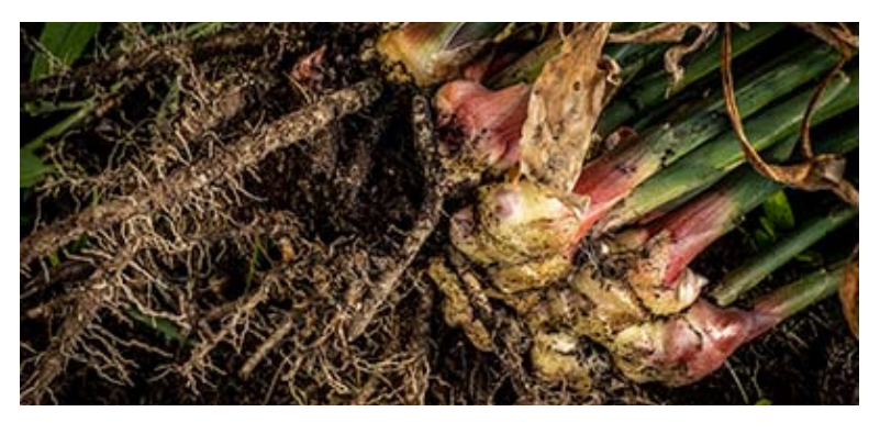
TURMERIC ( Curcuma longa ) is in the ginger family and is being researched for its anti-inflammatory properties to help with arthritis, digestive disorders, respiratory infections, allergies, liver disease, depression, and more. Planting soil and timing is much like that for ginger. Turmeric has tropical foliage and showy flowers and grows well in partial to full shade.