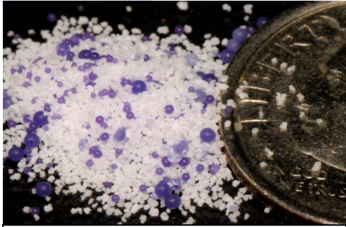
Plastic microbeads from facial scrub (next to a dime for size)

Toothpaste label showing polyethylene (plastic)