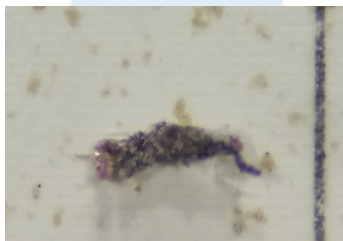
Microscopic plastic fiber and pieces found in coastal Florida waters.