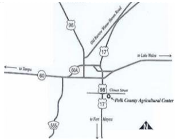
Polk County Extension Office 1702 S Holland Pkwy, Bartow, FL 33830 Main Office: (863) 519-1041

GCREC - Balm Gulf Coast Research & Education Center 14625 County Road 672 Wimauma, FL 33598 (Contact Manatee County Extension for Registration)