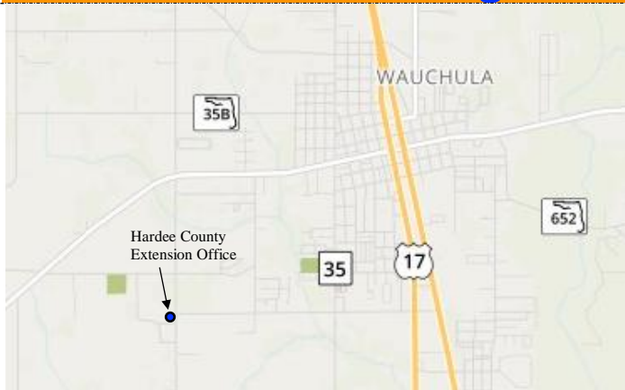
Hardee County Extension Office 507 Civic Center Dr, Wauchula, FL 33873 Main office: (863) 773-2164