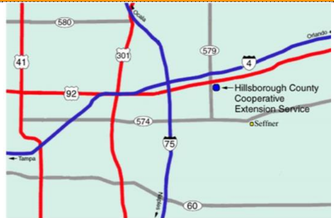
Hillsborough County Extension Office 5339 County Rd 579, Seffner, FL 33584 Main office: (813) 744-5519