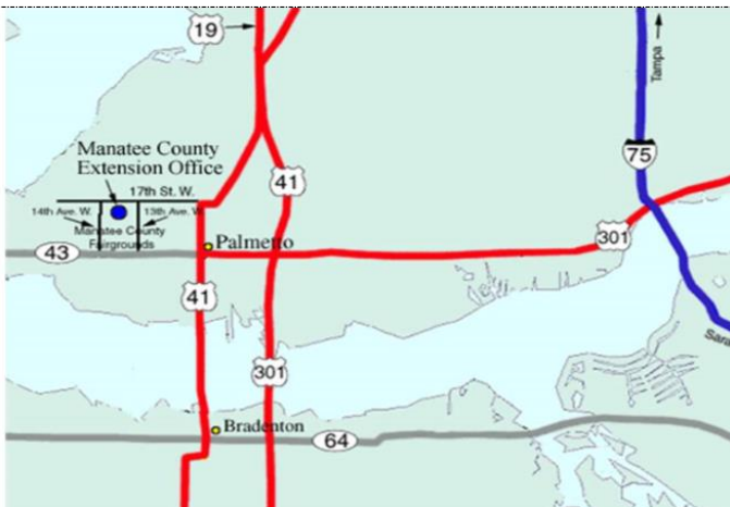
Manatee County Extension Office 1303 17th St W, Palmetto, FL 34221 Main office: (941) 722-4524