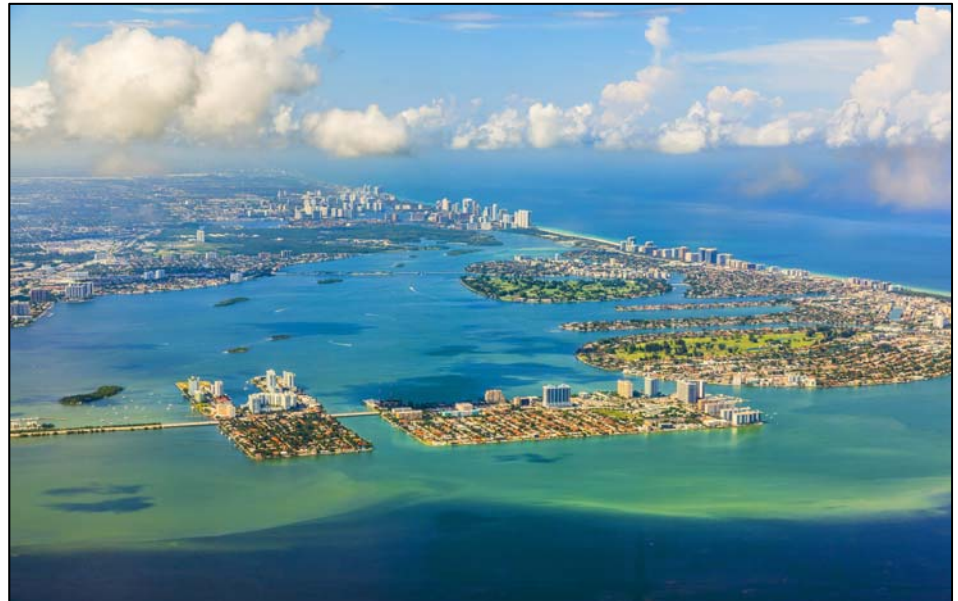
Biscayne Bay dominates the vista of northern Miami-Dade County, the most populous county in Florida.

However, one of the key assets within the Miami-Dade County portfolio is the natural environment in which it is cradled . The county is bordered by the Everglades to the west, the Florida Keys to the south, and the beaches and Biscayne Bay to the east. These natural amenities, and their inherent quality, play a key role in attracting an estimated annual total of 14 million overnight visitors to the area. And of the various activities pursued by these domestic and international visitors, approximately 80% of visitors experienced the beaches, Key Biscayne, and/or local water sports/activities . 2 The estimated economic impact of all visitors to the Miami-Dade County economy is $34.2