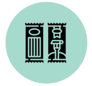
Food Non-perishables Supplies