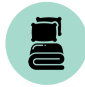
Blankets and Pillows