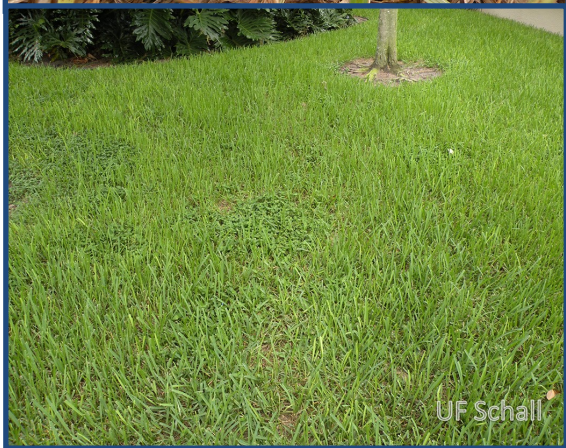
Top: advanced browning and dead 'Floritam.'