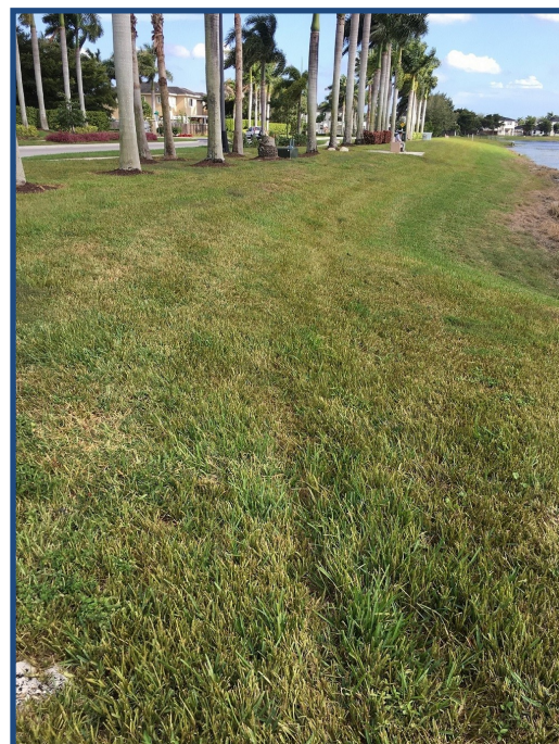
Infected "Floratam" field. Visible dead patches along the wheels of the mowers.