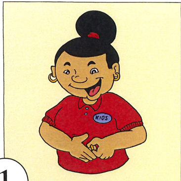
1 Remove jewelry, except for plain wedding band.

Hand washing is an important way to reduce the fecal-oral transfer of germs that cause diseases. Young children and frail elders have less ability to fight germs than others. As a caregiver you can help reduce the risk of diseases that can be transmitted in a crowded environment by using proper hand washing procedures.