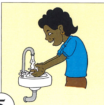
5 Rinse your hands and wrists under running water.