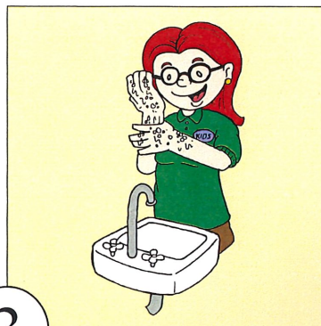
3 Lather hands and wrists with soap for 20 seconds. (Sing the Happy Birthday song twice).