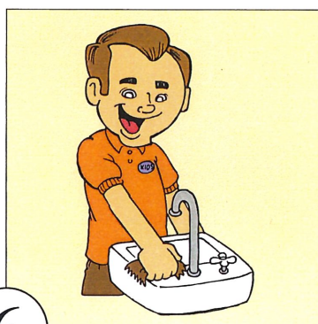
6 Use a paper towel to turn off the water. Dry hands and wrists with clean, disposable paper towels. If you use hand sanitizer, apply it now.