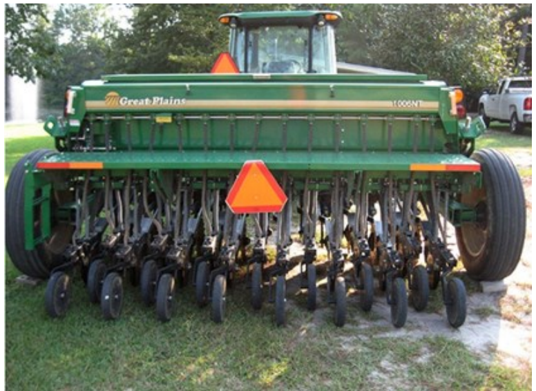
No-till drill planter.

Options might include mowing, light disking, moldboard plow, heavy-disk harrow, rototiller, or many other cultivating tools to prepare the seedbed. Level the area before planting. Overseeding (planting over the existing pasture) is an option but requires special equipment like a no till drill. You can broadcast over sod with ryegrasses and clovers. When planting over your established pasture, it is important to wait until after the first frost.