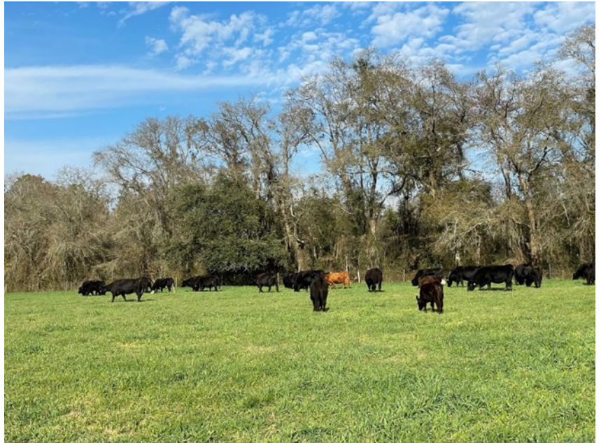
Cattle grazing ryegrass in February

It is the time of year to start implementing cool-season forages in your pastures. Our perennial warm season pasture grasses in Florida become dormant in the fall and winter months because of the shorter days, cooler temperatures, and frosts. Planting a cool-season forage provides many benefits to your herd. These grasses are usually higher in total digestible nutrients (TDN) and crude protein (CP) than our summer grasses or hay. Being strategic when planting and growing these forage crops is essential to the success of the establishment and success of your cool-season forage pastures. The