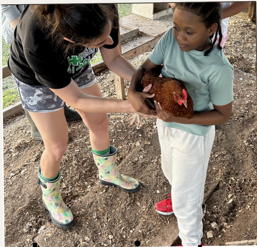
Learning to hold