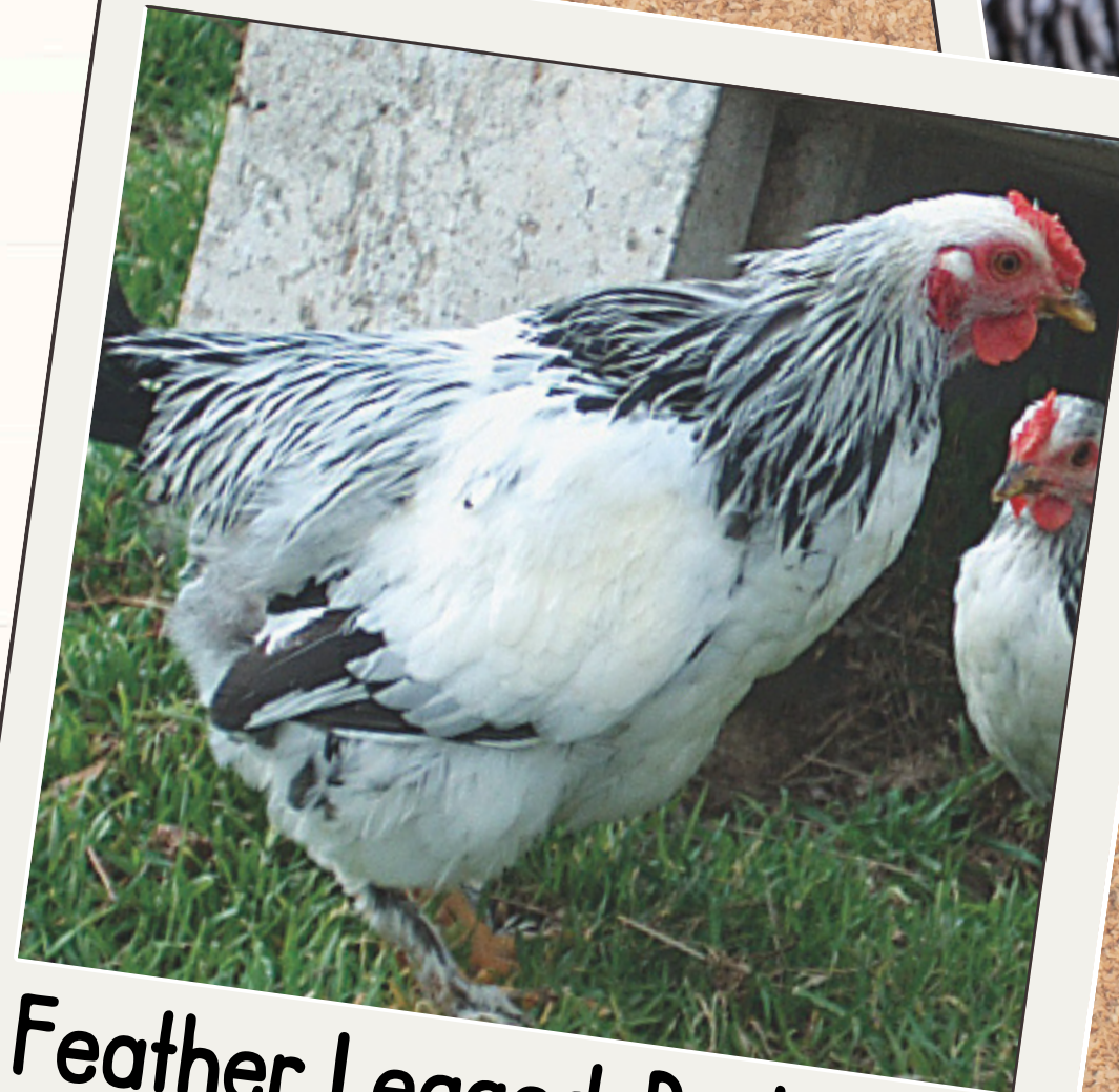
Feather Legged, Brahmas