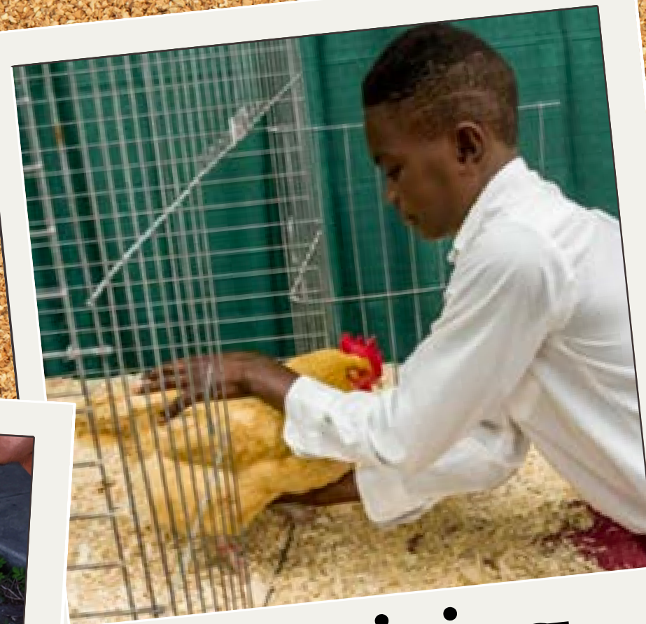
Practicing taking out of cage for showmanship