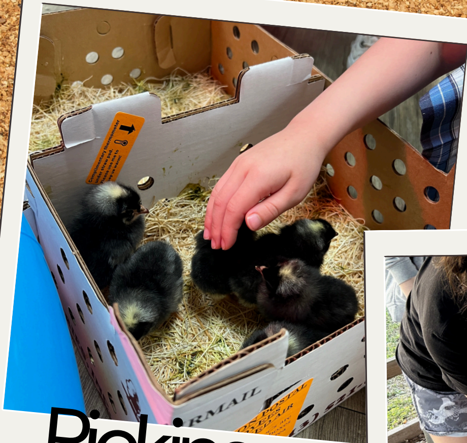
Picking out Chicks