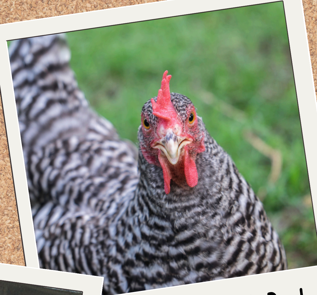
American, Plymouth Rock