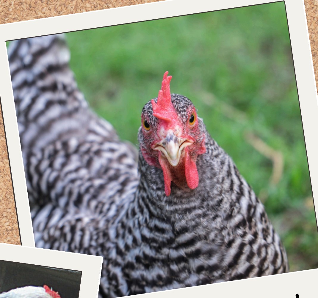
Barred, Large Fowl