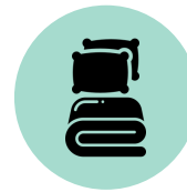
Blankets and Pillows