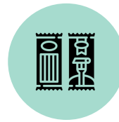
Food Non-perishables supplies