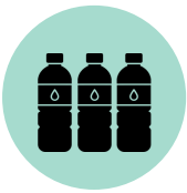
Safe Water Supply