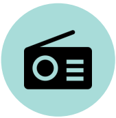
Battery Powered Radio

During an emergency situation, you may not have time to gather up supplies. This is why preparing a disaster kit in advance is important. This kit should contain all important items detailed below, and be able to easily be taken with you in the event of an evacuation. Plan for at least three days. It is a good idea to keep what supplies you can to get herin advances o that you do not have to scramble to prepare at the last minute. Keep in mind that some items, such as medication, might only be able to be added in later or may need to be updated regularly.