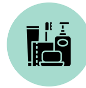
Toiletries Hygiene items