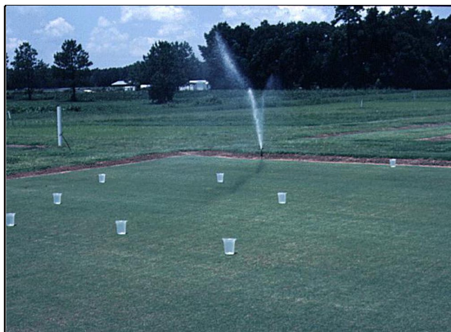
Figure 1. Calibrating a Sprinkler System

Knowing the amount of water your sprinkler system applies to your landscape is an important step in efficient water use. Most people irrigate their landscape for a given number of minutes without knowing how much water they are really applying. This may lead to over- or under-watering, neither of which will benefit the landscape nor the environment. Calibrating will help you to apply the correct amount of water to your landscape. Whether you have an in-ground system or a hose and a sprinkler, the following steps will calibrate your system: