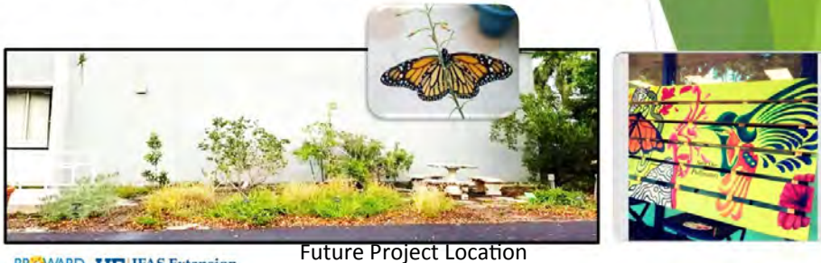
Future Project Location