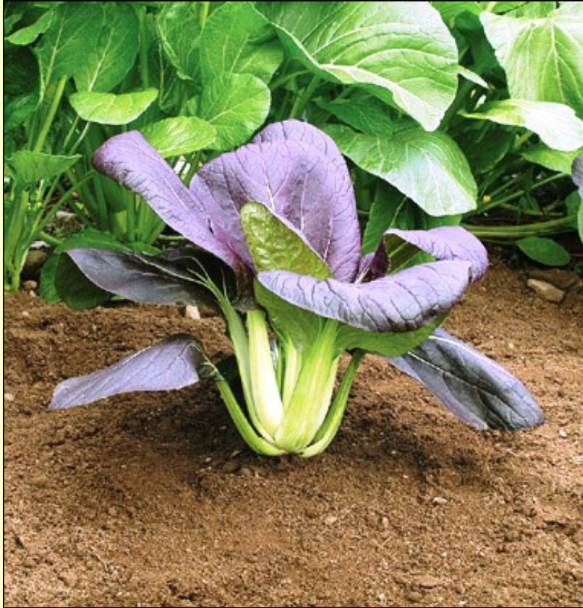
Red Choi F1