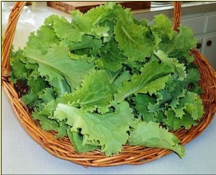
Henderson's Black Seeded Simpson Lettuce OP