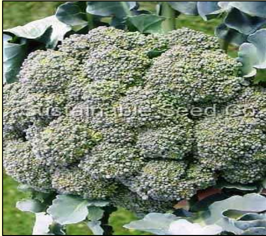
Waltham 29 OP