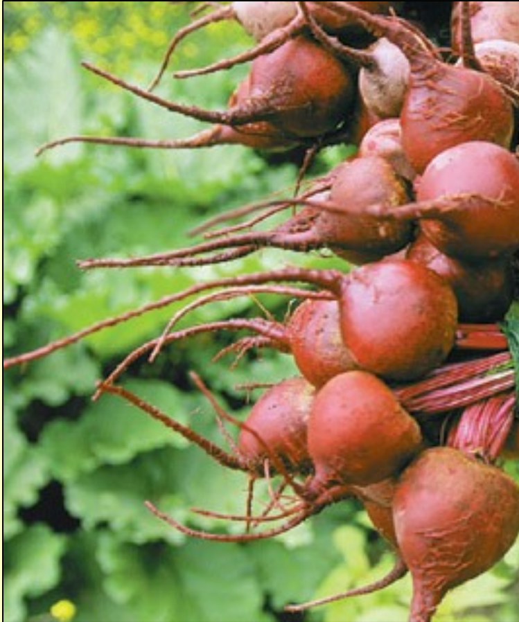
Red Ace F1