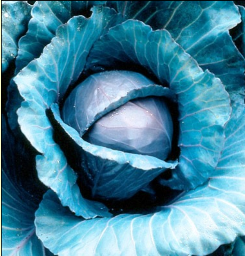
Red Express OP