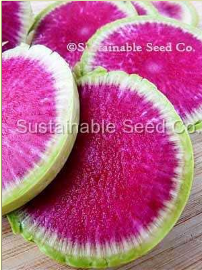
Red Meat “Watermelon” OP