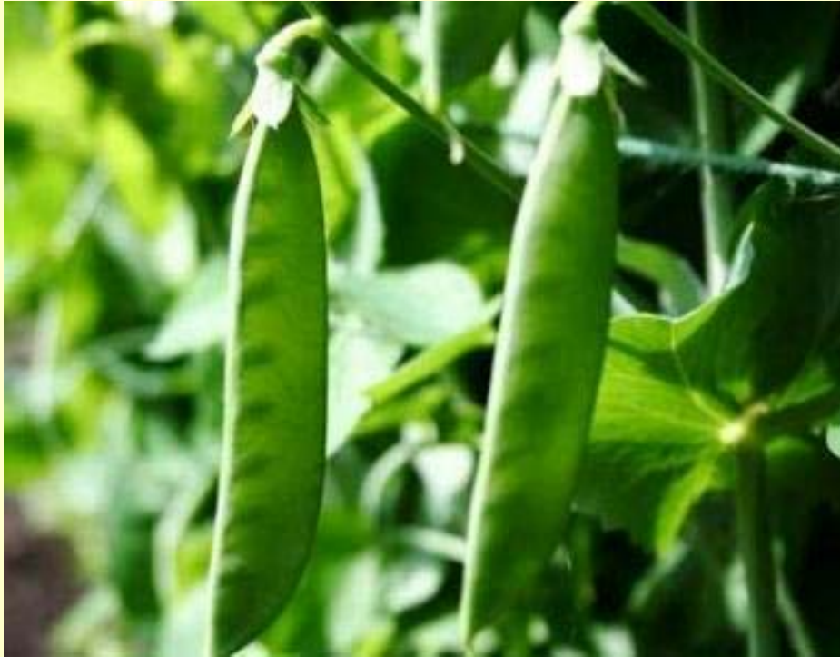
Oregon Sugar Pod II OP