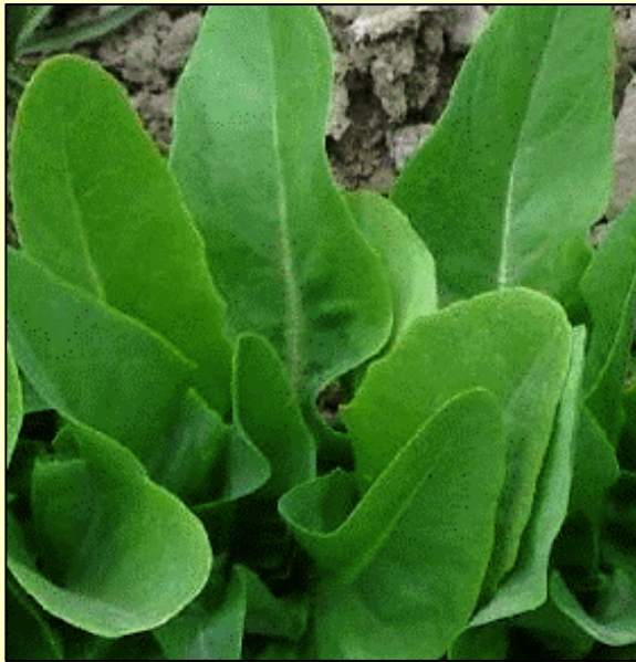
Deer tongue OP