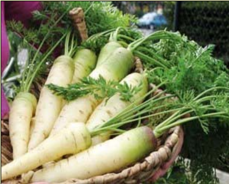
White Satin F1