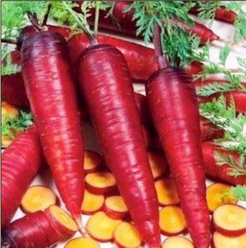
Purple Haze F1