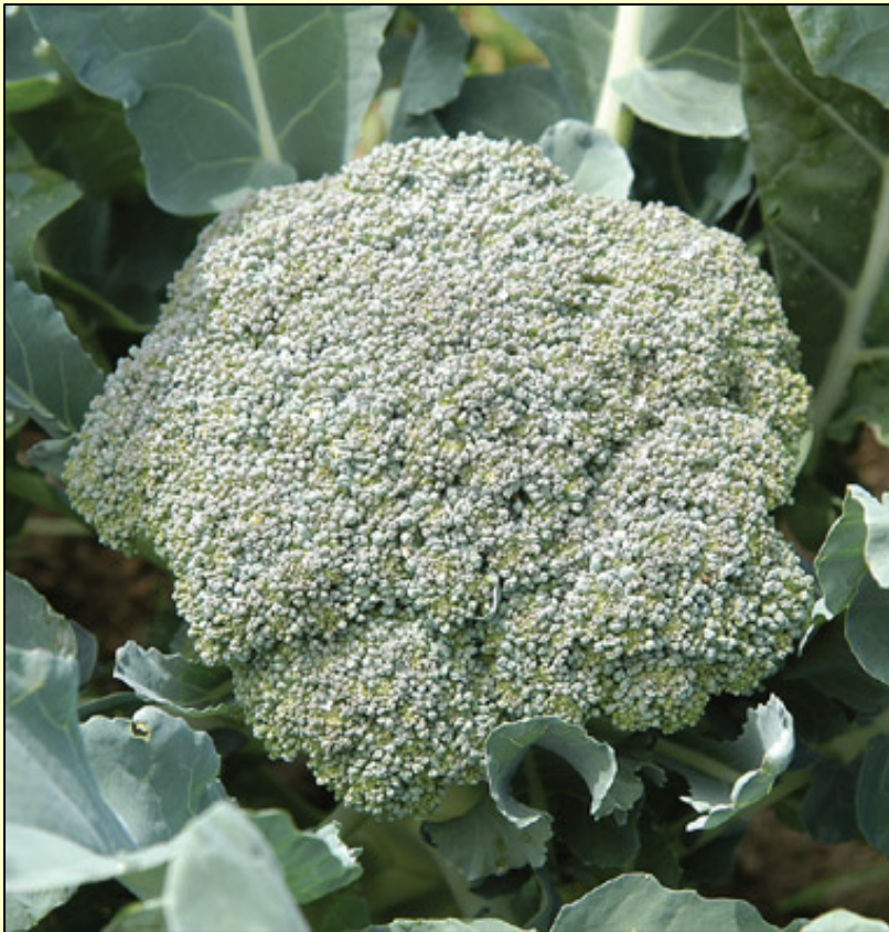
Green Magic F1