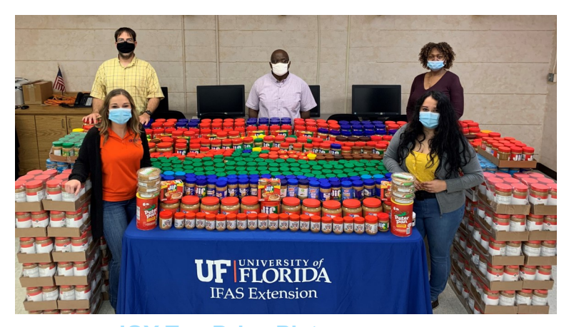
JOY Toy Drive Pictures:

Jefferson County held the annual peanut butter drive and came in second in the region with 1300 jars of peanut butter. The peanut butter will be distributed to area churches, shelters, and all those that need a helping hand. Go Team!!!