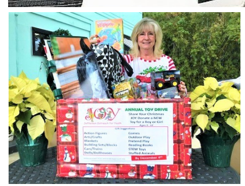
One of our many community Sponsors.