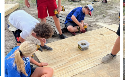
Visit our FB Page for more photos. UF IFAS Extension Lafayette County 4-H