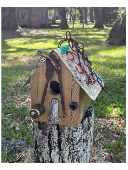
Why you should never throw anything away! Great job Kenly Melland.