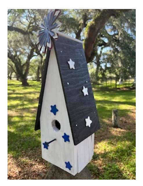
Stars are shining on Parker Gaskins' birdhouse.