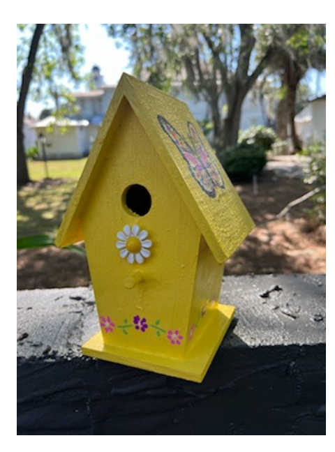
Karoline Beach loves the color yellow and daisies.