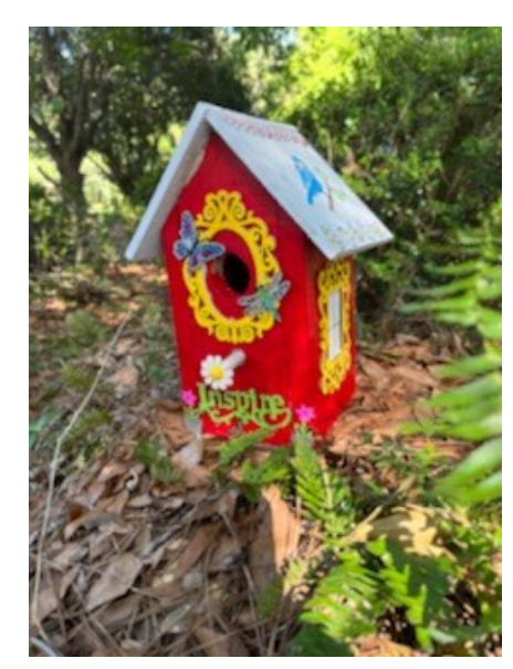
Sophia Burak has built an inspiring bird-house for sure!