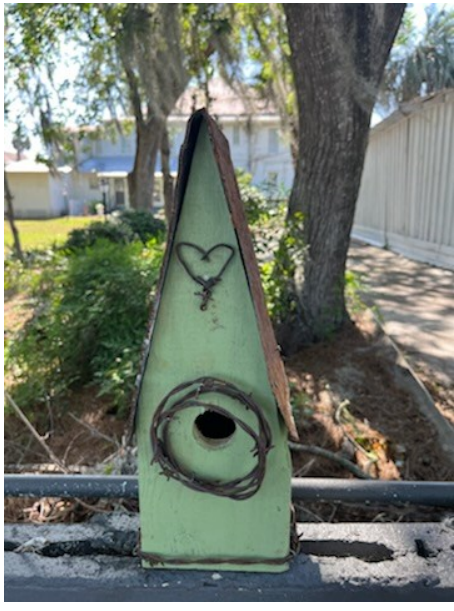
Kurt Sanders was determined to put some barbwire on this bird house...and it looks good!