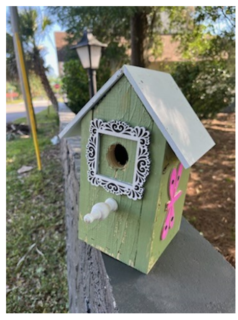
Trevor Moseley insists there are bright pink dragon flies...maybe in Day Town?