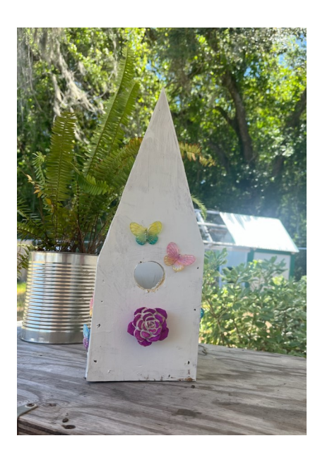
Rylie Creel has made a beautiful birdhouse with roses and butterflies.