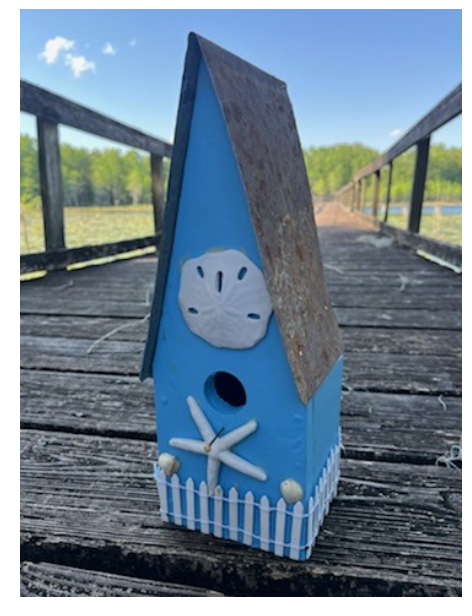
Lanae Colson loves the beach! Can you tell??