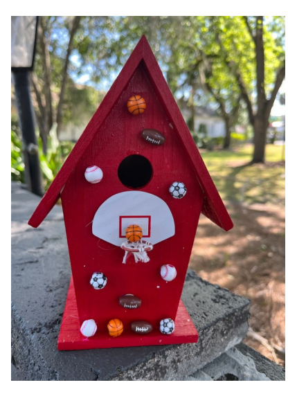
Wyatt Creel is ready to "Play ball"! Any kind of ball.