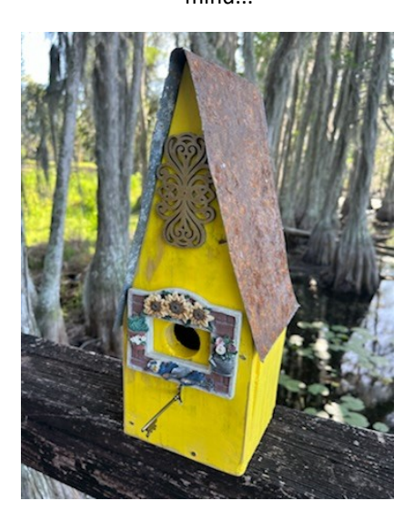
Looking good Brantley Porr!