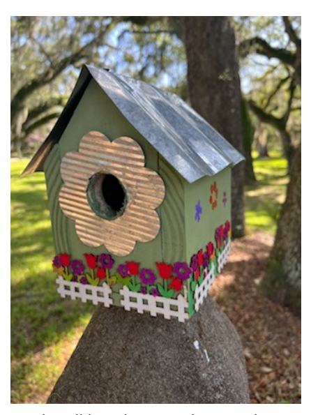
Birds will love hearing the rain drops on the tin roof of Tinley Jackson's birdhouse