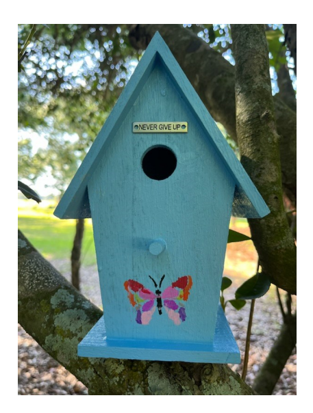
Great advice Ellery Dykes!