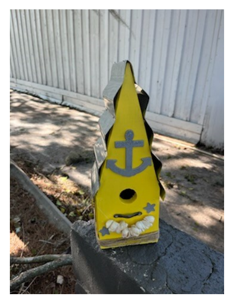
Anchors away! Lets get some birds in Ella Dodson's awesome birdhouse!