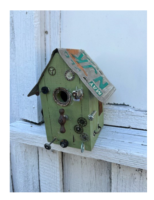
Pablo Ballesteros has a big heart and wants the birds to have plenty of things for them to play with.