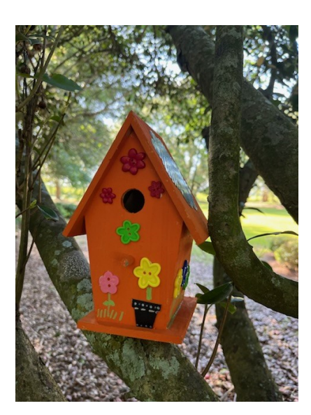
Elias Ballesteros's home is simple but awesome!