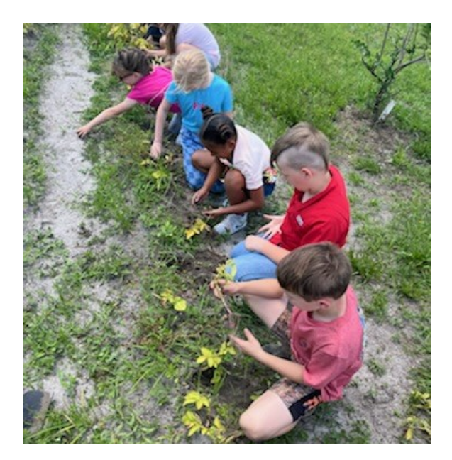
Second graders digging potatoes from the LES Garden.

LES 2<sup>nd</sup> Graders were recently able to dig the potatoes they planted a few months prior. The five classes had planted 15-20 pounds of potatoes in February and were able to harvest over 100 pounds which were divided up for the students to take home. They also harvested the remainder of the fall crops still growing in the school garden including celery, turnips, radishes and lettuce.