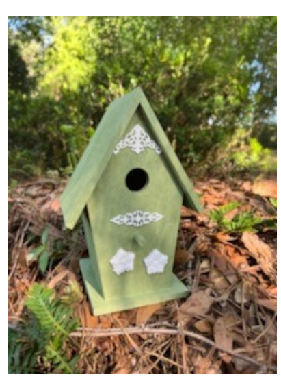
Just a pretty birdhouse trimmed in white. It's very nice Derby Sherrell.