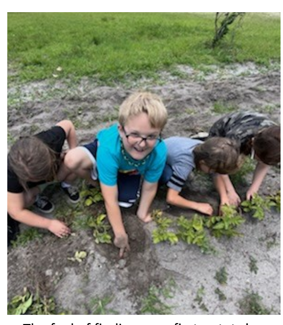
The feel of finding your first potato!