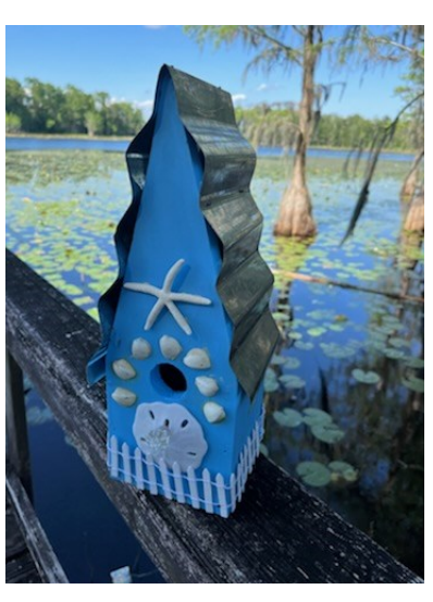
Every bird needs their own beach house! Way to go Tatum Hart!