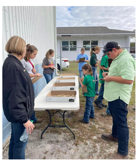
4-Hers from 6 counties in Florida participating in the Lafayette Farm Judging Competition.