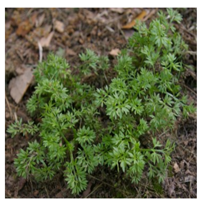
Lawn Burweed pictured above.

Lawn Burweed has probably already made its emergence in lawns but it can be controlled and burs can be stopped if you take action now. The burs in this pesky weed are not produced until the spring but once they are there, they can not be controlled. So, the key to treatment is to spray and herbicide now that will make walking across your lawn barefoot next summer an enjoyable experience instead of a painful one. There are several effective postemergent herbicides for burweed like Atrazine (not safe for Zoysia or Bahiagrass), Metsulfuron (not safe for Bahiagrass or ornamentals) as well as 3-way formulations like Dicamba, Mecoprop, and 2, 4-D or Thiencarbazon, iodosulfuron, and Dicamba (not safe for Bahiagrass). All of these options are more effective with a follow-up application 10 to 14 days after the first application. Be sure to read the label of your herbicide of choice prior to application. If you have any other questions, please feel free to reach out.