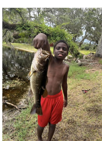
Photo Top Left, clockwise: Camp USA participants with their stain glass project. Campers painting glass. Large bass caught at Jackson Murphy Camp USA Day at Pickett Lake. Canoeing and kayaking was a popular water sport on Pickett Lake during Camp USA.