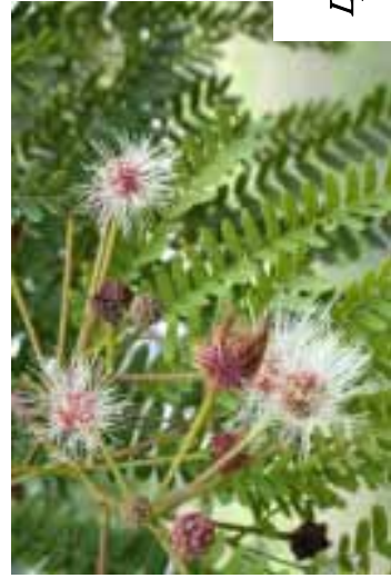
Wild tamarind Lysiloma latisiliqua