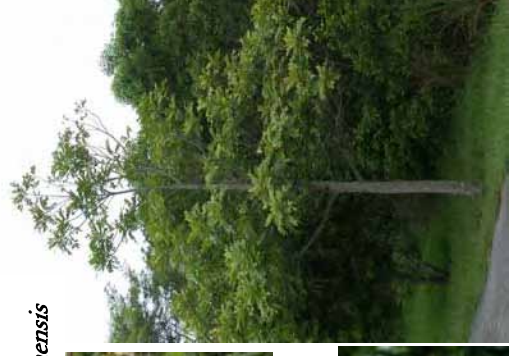
Paradise tree Simarouba glauca