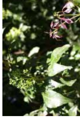
Torchwood Amyris elemifera