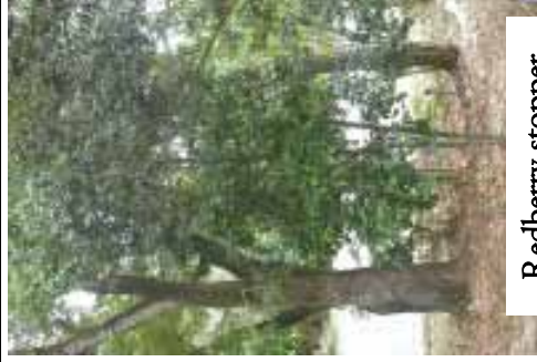
Redberry stopper Eugenia confusa