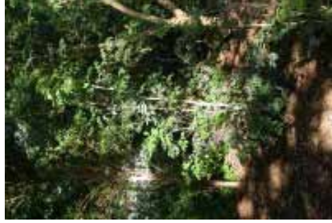
Red stopper Eugenia rhombea