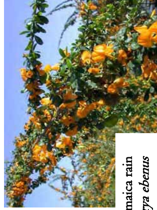
Jamaica rain Brya ebenus