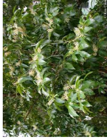
West Indian cherry Prunus myrtifolia