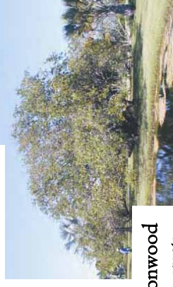
Green buttonwood Conocarpus erectus