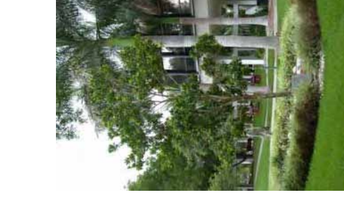
Allspice Pimenta dioica