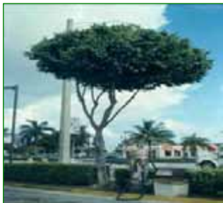
Bad Practice: Lions tailing, shaping