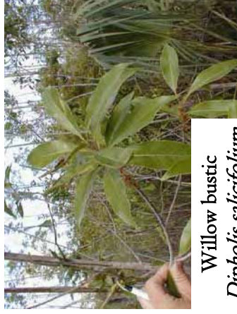
Willow bustic Dipholis salicifolium