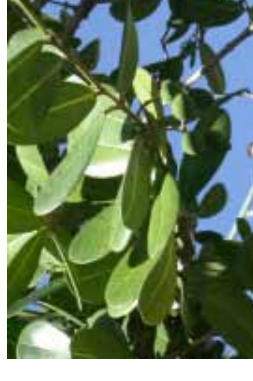
Madagascar olive Noronhia emarginata