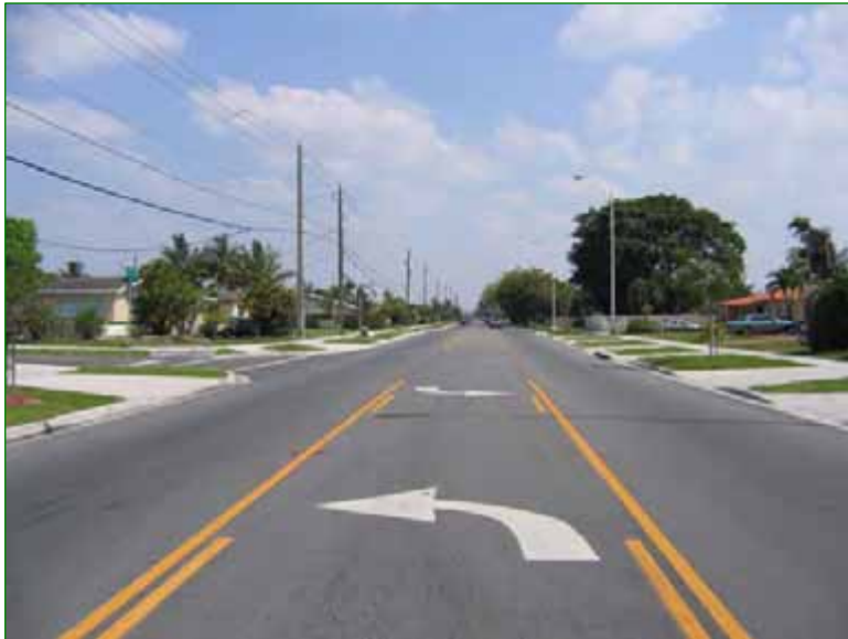
When gray infrastructure wins over green

With all the positive benefits, one would assume that tree canopy would be a priority for Miami-Dade County. A 1996 analysis by the non-profit organization American Forests, in partnership with Miami-Dade County, determined that the tree canopy cover in unincorporated Miami-Dade County averaged only about 10 percent with some municipalities showing as little as one to two percent tree coverage. The average metropolitan area in the United States has a tree canopy of 33.4 percent. Optimal urban canopy coverage is considered to be 40-45 percent. In addition, the existing canopy consists of a high percentage of non-native invasive species and inferior quality trees, some of which threaten natural areas or are hazards in windstorms. There is a disconnect between knowing that adequate tree canopy is essential for the livability of our community and the number of the public policies that are currently in place. It is important to note that seven municipalities have taken the lead with their tree policies and earned Tree City USA recognition: Aventura, Coral Gables, Miami, Miami Gardens, Miami Springs, North Miami, and North Miami Beach.