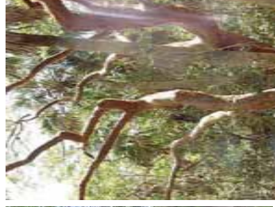
Gumbo limbo Bursera simaruba