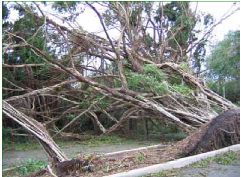
Shallow roots, too small space

✿ Hurricanes and other windstorms: As the frequency and strength of hurricanes and windstorms have increased in Florida, the media and general public often focus on tree failures. Taking a closer look, there are lessons to be learned from previous hurricanes. It is difficult to educate the public on all the nuances of trees. The power outages, tree damage, and the time and costs of clean-up have many South Florida residents leery of trees. In fact, certain species of well-placed trees can actually serve as a wind block and protect property. Inferior quality trees, trees with overly dense canopies, trees that have been "hatracked" (hatracking is a big cause of overly dense canopy), can split or lose large limbs during strong winds. Prevention efforts such as species selection can impact the survivability of a tree. Furthermore, brittle or shallow rooted trees can blow over at low wind speeds. Trees that are professionally pruned fall less than unpruned trees. Increased reports of illegal tree removal or "hatracking" often follow storm events where tree "experts" damage the tree for future storms.