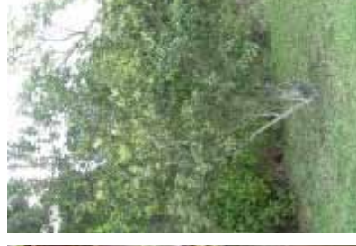
Inkwood Exothea paniculata