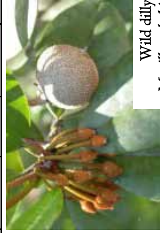
Wild dilly Manilkara bahamensis