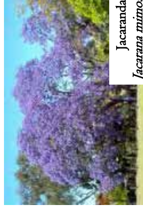
Jacaranda Jacarana mimosifolia