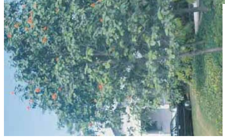
Geiger tree Cordia sebestena