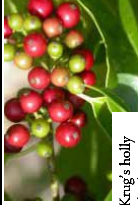
Krug's holly Ilex krugiana