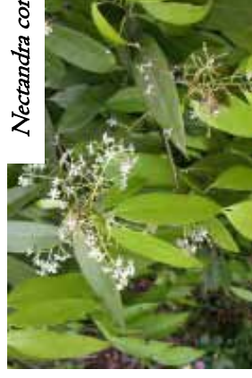
Lancewood Nectandra coriacea