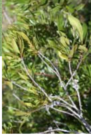
Wax myrtle Myrica cerifera