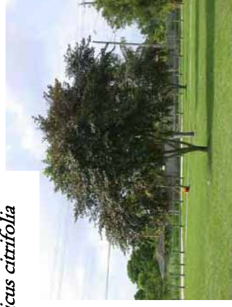
Shortleaf fig Ficus citrifolia