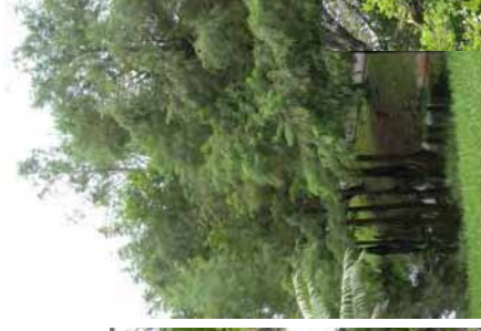
Bald cypress Taxodium distichum