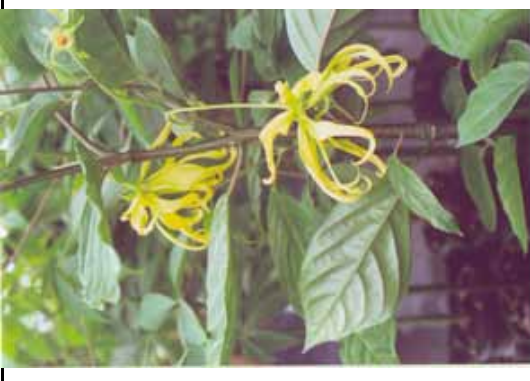
Ylang-Ylang Canaga fruticosa