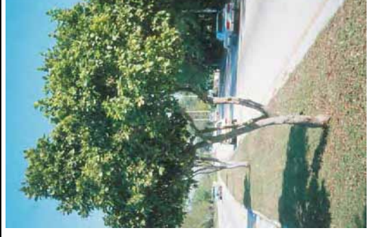
Pigeon plum Coccoloba diversifolia