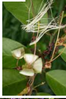
Limber capper Capparis flexuosa