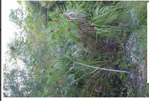
Winged sumac Rhus copallina