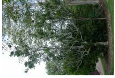
Guinea plum Drypetes laterifolia