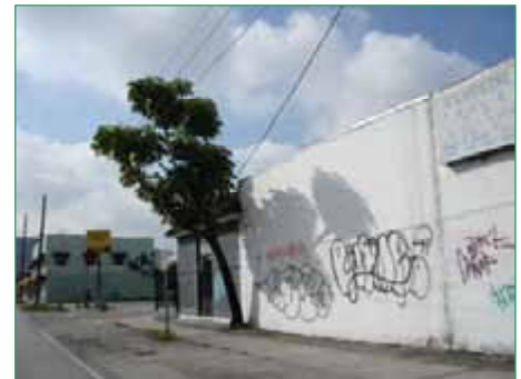
Invasive exotic tree, too close to building and power lines

✿ Planting the wrong tree in the wrong place: Urban areas frequently have limited space for roots and canopy due to power lines and other utilities, signs, water requirements, poor or sometimes excessive drainage, and paving. These conditions cause the stress that is most often the cause of tree mortality in commercial/industrial areas. Historically, fast-growing trees, trees with an inexpensive purchase price that were Florida Grade #2 or cull, which are inferior quality, also found their way into the public rights-of-way. Some of these street trees are messy (black olive) or have low wind tolerance ( Ficus benjamina ) which can erode public support for street trees. Even quality trees and native species need room and proper soil conditions to grow.