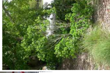
Black ironwood Krugiodendron ferreum