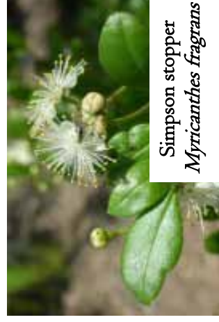
Simpson stopper Myricanthes fragrans