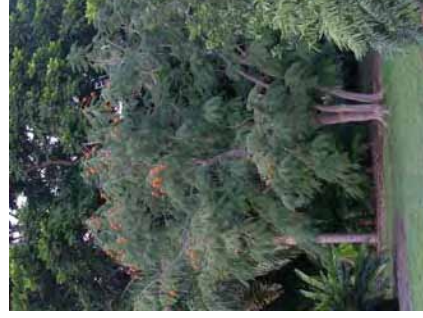
Colville's glory Colvillea racemosa