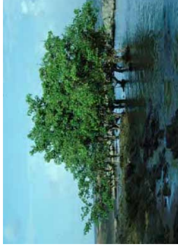
White mangrove Laguncularia racemosa