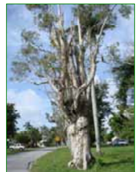
Invasive Exotic Melaleuca Tree