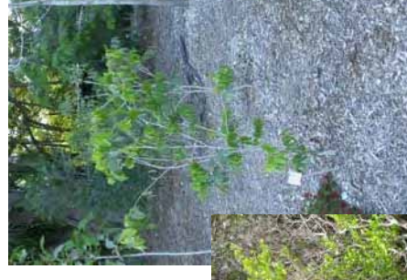
Bitterbush Picramnia pentandra