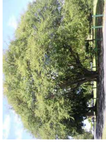
Brown ebony Caesalpinia punctata