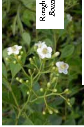
Rough strongbark Bourreria ovata