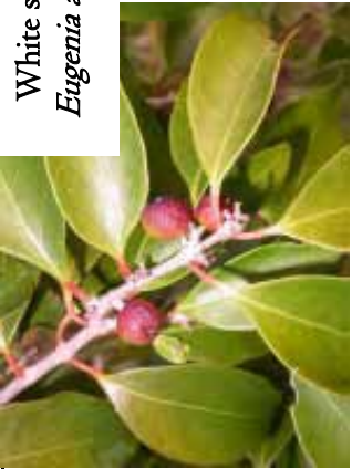
White stopper Eugenia axillaries