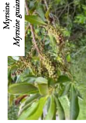
Myrsine Myrsine guianensis