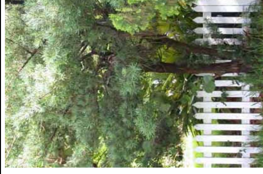
Podocarpus Podocarpus sp.