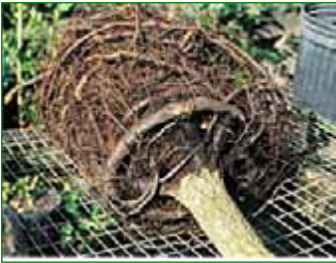
Defective Roots: Circling