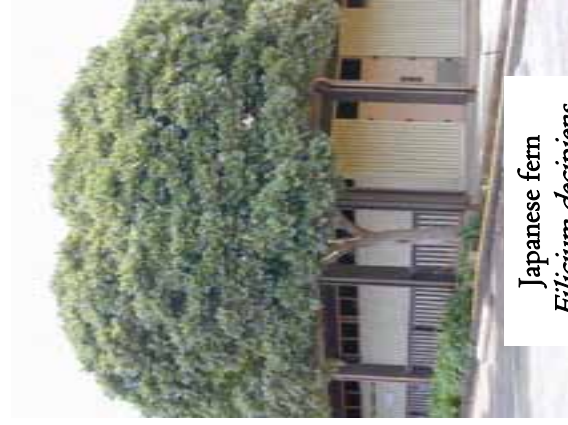
Japanese fern Filicium decipiens