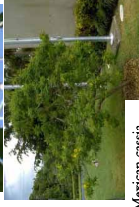
Mexican cassia Caesalpinia mexicana