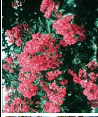
Crape myrtle Lagerstromieia indica