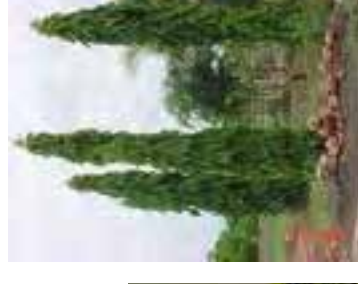
Mast tree Polyalthia longifolia