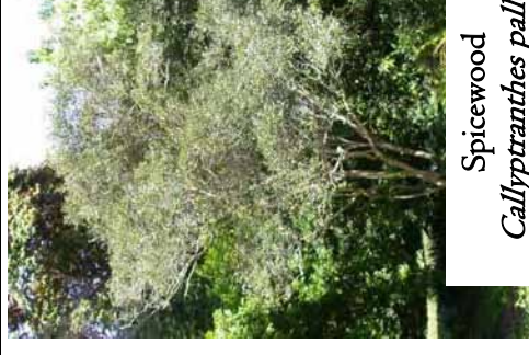
Spicewood Callytranthes pallens