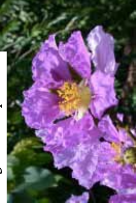
Queen's crepe myrtle Lagerstroemia speciosa