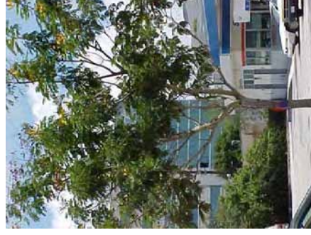
Copperpod Peltophorum pterocarpum