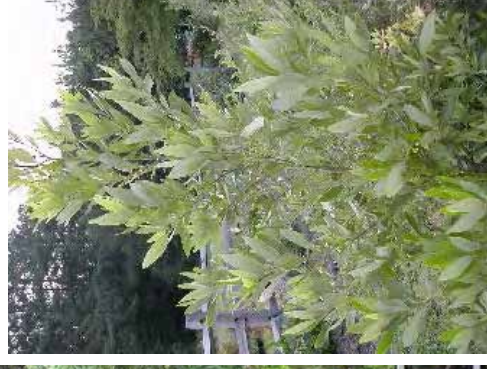
Red bay Persea borbonia