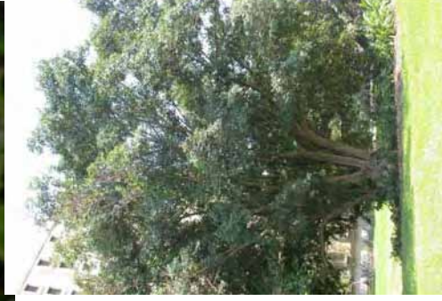
Satinleaf Chrysophyllum oliviforme