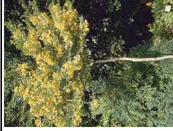
Desert senna Senna polyphylla