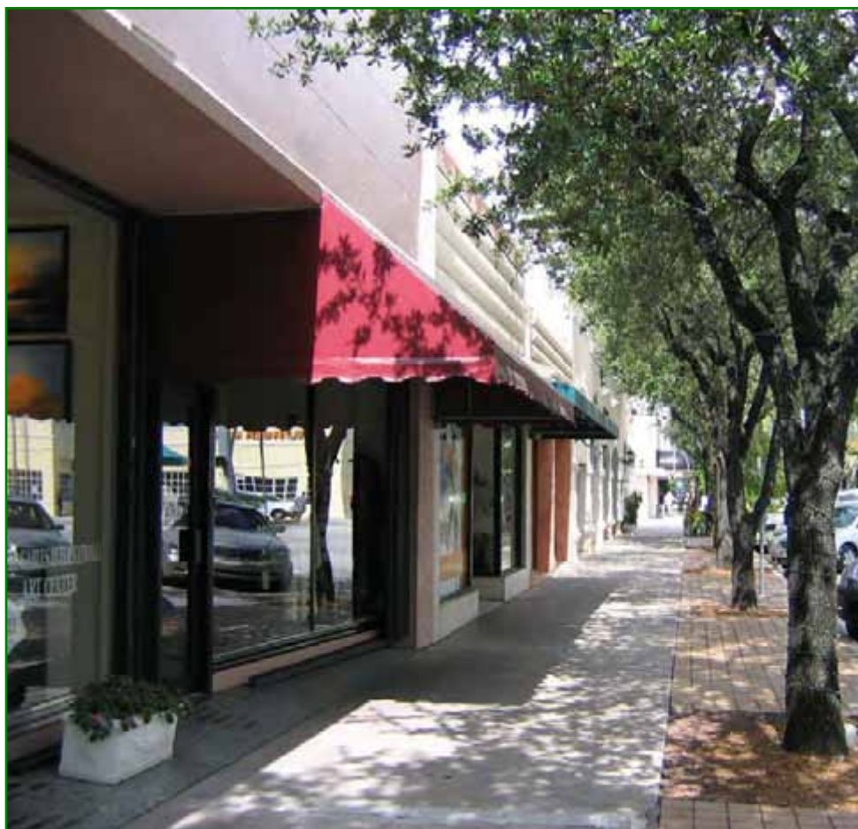
Street Trees along Miracle Mile, Coral Gables, Florida

The Street Tree Master Plan is dedicated in memory of JOSE R. BACALLAO whose persistence and guidance motivated County staff during its early development.