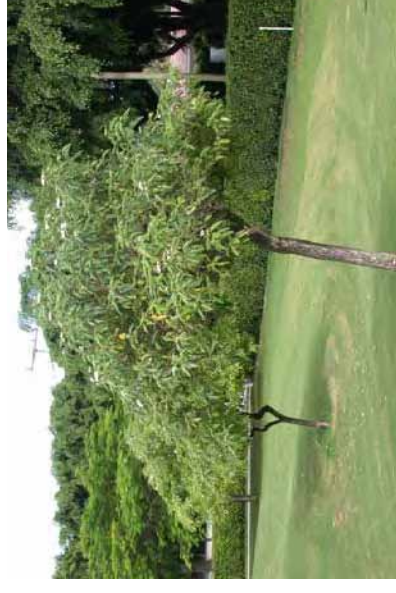
White cordia Cordia boissieri