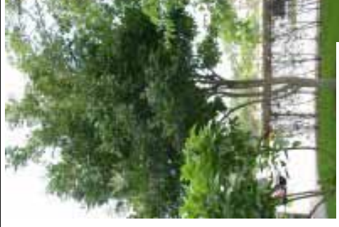
Soapberry Sapindus saponaria