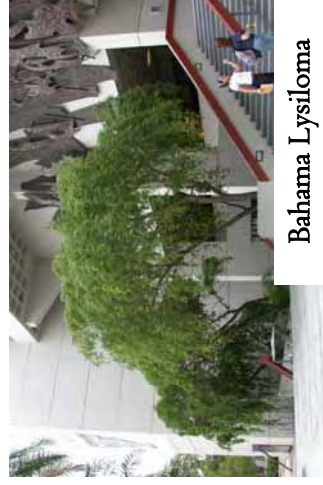
Bahama Lysiloma Lysiloma sabicu