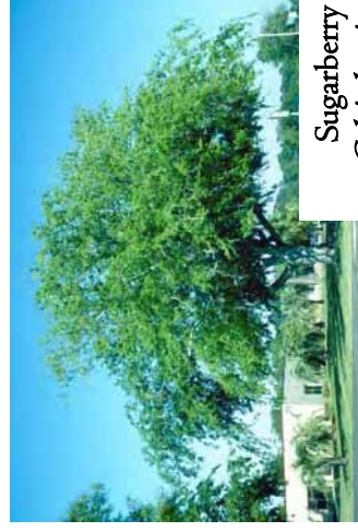
Sugarberry Celtis laevigata