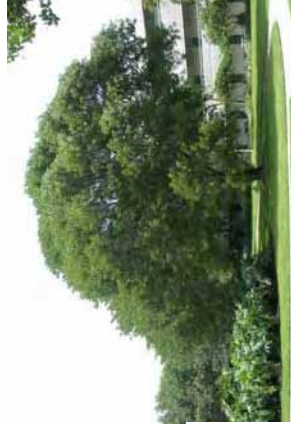
Mahogany Swietenia mahagoni