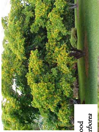
Vera wood Bulnesia arborea