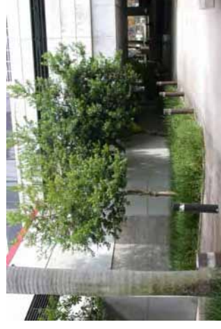
Dahoon holly Ilex cassine