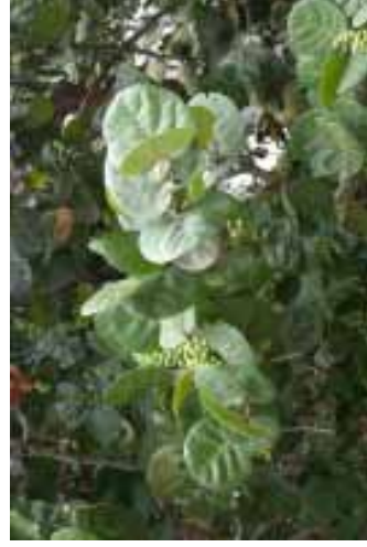
Sea grape Coccoloba uvifera