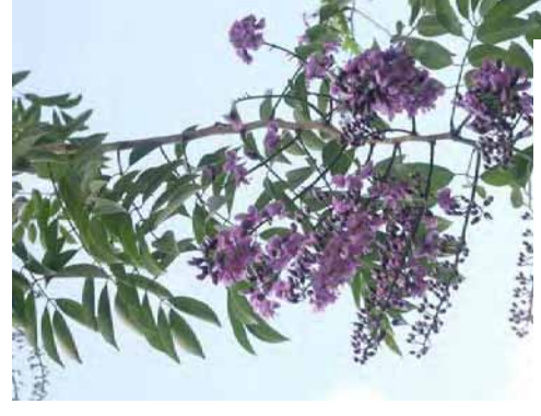
Lancepod Lonchocarpus violaceous