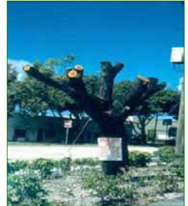
Bad Practice: Hatracked Tree

✿ Improper pruning, lack of maintenance: The lack of maintenance or improper maintenance including pruning, fertilization, mulching, and replacement of trees that have died, become a hazard, or are in a state of decline. Topping and excessive pruning practices such as "hatracking" or "lion-tailing" lead to mortality in urban trees. "Hat-racking" is illegal in Miami-Dade County under the landscape and tree code. Contrary to popular belief, "Hatracking" actually makes a tree more hazardous in high winds by replacing strong limbs with weak ones that will break off in subsequent years. Many trees are pruned by yard services and maintenance contractors without the proper training or arborist certification. Misconceptions about correct pruning methods and frequency of pruning have created a need for educating both the public and landscaping businesses. The information is available on the web ( http://hort.ifas.ufl.edu/woody/pruning ), in books, pamphlets produced by the Cooperative Extension office and the International Society of Arboriculture, and at education programs but many people do not avail themselves to this information.