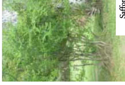
Saffron plum Bumelia celastrinum