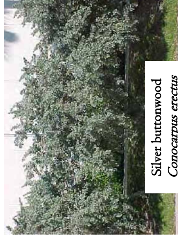
Silver buttonwood Conocarpus erectus