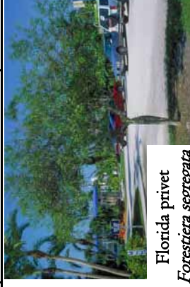
Florida privet Forestiera segregata