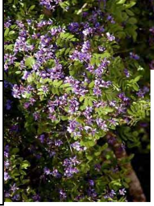
Lignum vitae Guaiacum sanctum