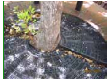
Bad Practice: Tree Grate Girdling Tree