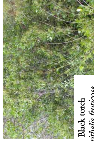
Black torch Erithalis fruticosa