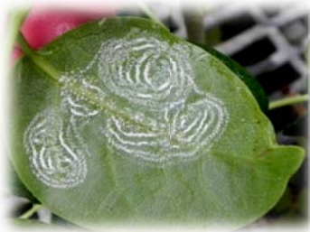
Eggs are laid in spirals.

But DON'T panic. This whitefly is different from the ficus whitefly. So far, the gumbo limbo spiraling whitefly is not causing severe plant damage such as plant death or severe branch die-back.