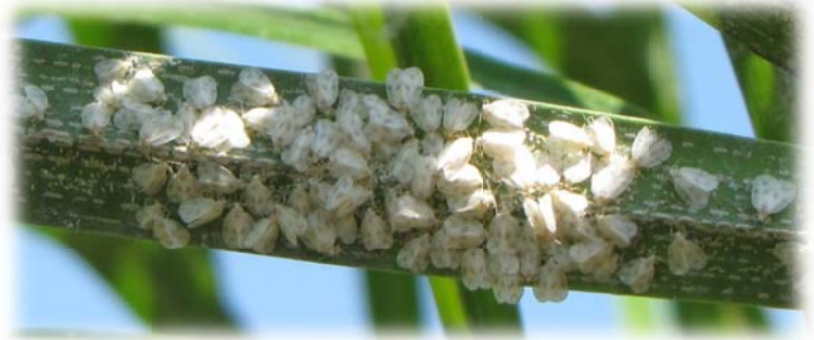
Adults on the underside of a palm leaflet.

But DON'T panic. This whitefly is different from the ficus whitefly. So far, the gumbo limbo spiraling whitefly is not causing severe plant damage such as plant death or severe branch die-back.