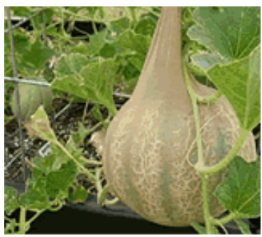
Cantaloupe in pantyhose