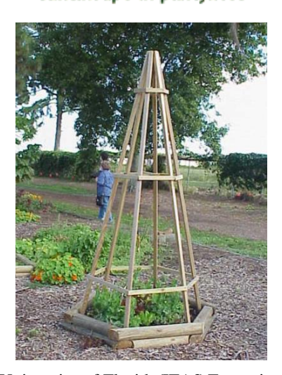
University of Florida/IFAS Extension