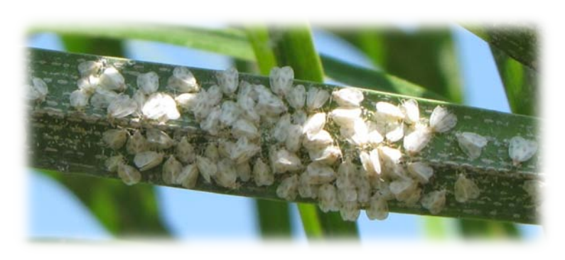
Adults on the underside of a palm leaflet.

<u>But DON'T panic</u> . This whitefly is different from the ficus whitefly. So far, the gumbo limbo spiraling whitefly is not causing severe plant damage such as plant death or severe branch die-back.