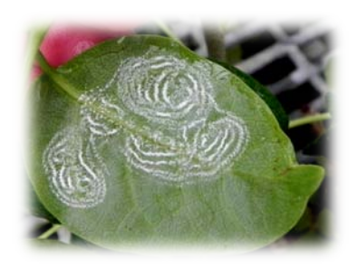
Eggs are laid in spirals.

<u>But DON'T panic</u> . This whitefly is different from the ficus whitefly. So far, the gumbo limbo spiraling whitefly is not causing severe plant damage such as plant death or severe branch die-back.