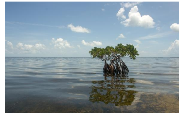
Mangrove in Biscayne Bay

Over the past decade several algal blooms have threatened the quality, health and beauty of the Bay, impacting its marine life and over 10,000 acres of bay bottom habitat. These events suggest that the Bay may not be as resilient as it once was. BBWW is helping to monitor the health and water quality of the Biscayne Bay to support a better future for our waters.