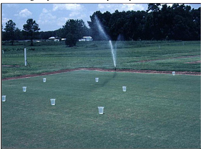
Figure 1. Calibrating a Sprinkler System

Knowing the amount of water your sprinkler system applies to your landscape is an important step in efficient water use. Most people irrigate their landscape for a given number of minutes without knowing how much water they are really applying. This may lead to over- or under-watering, neither of which will benefit the landscape nor the environment. Calibrating will help you to apply the correct amount of water to your landscape. Whether you have an in-ground system or a hose and a sprinkler, the following steps will calibrate your system: