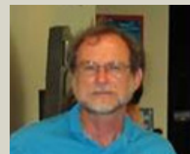
Drawing by Brent McCallister Landscape Architect Orange County Parks & Recreation

UF/IFAS Extension Orange County 6021 S. Conway Road Orlando, FL 32812 407-254-9200