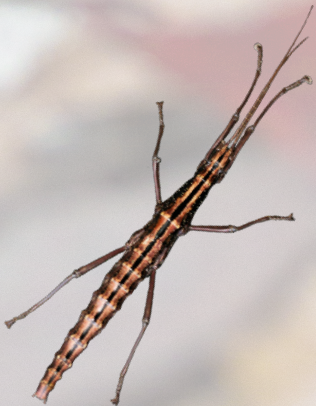
Two-striped walkingstick Anisomorpha buprestoides