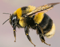
American bumblebee Bombus pensylvanicus