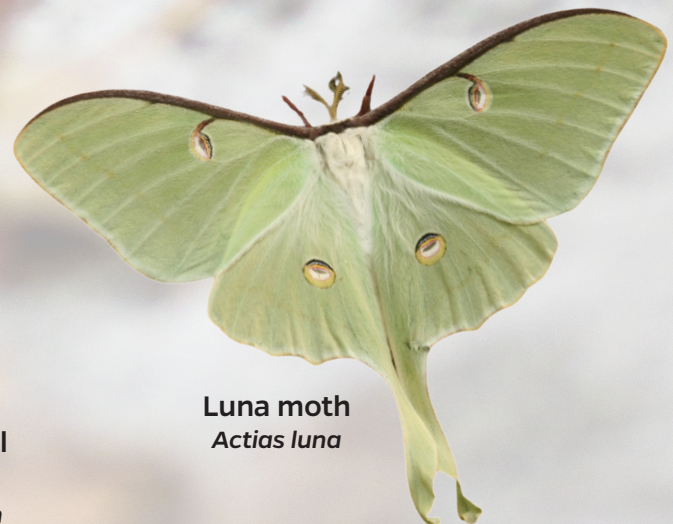
Luna moth Actias luna