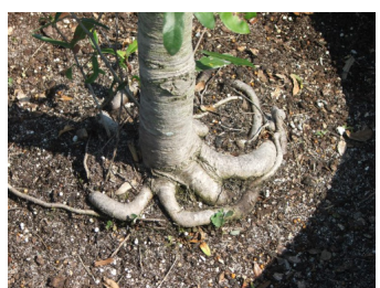
Circling roots will eventually girdle and kill tree.

Synthetic burlap does not decompose in soils. All synthetic material should be removed from the root ball prior to palm or tree installation. Failure to do so can result in girdling of the roots and ultimate failure of the tree.