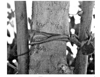
Tree support and trunk damage.

Supports should be removed within one year of planting to avoid damage to trunk.