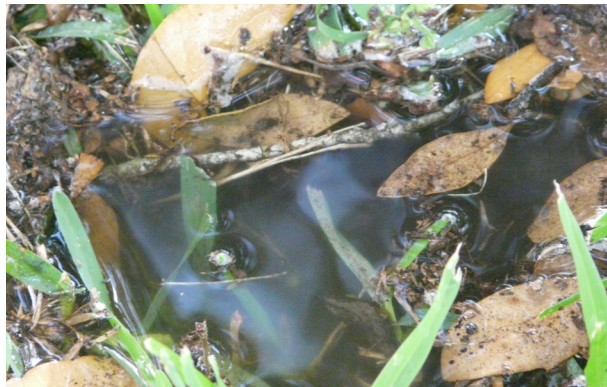
A buried sprinkler head wastes water.