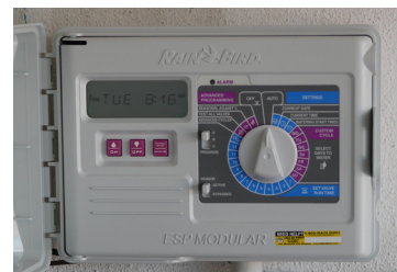
Typical irrigation system clock, with "Rain Sensor" setting.