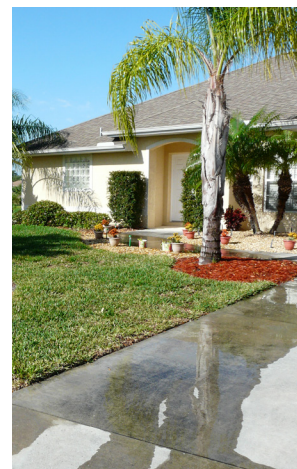
Wet driveways and sidewalks are signs of wasted water. Heads can be adjusted to spray lawn only.