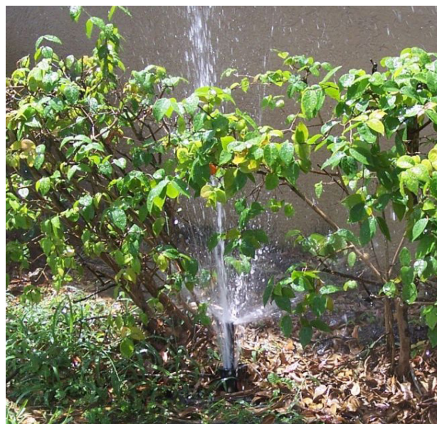
Leak in a sprinkler due to a worn seal.