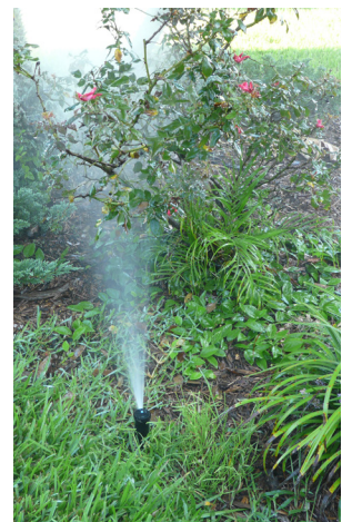
Sprinklers spraying established plants should be moved to the grass or capped.