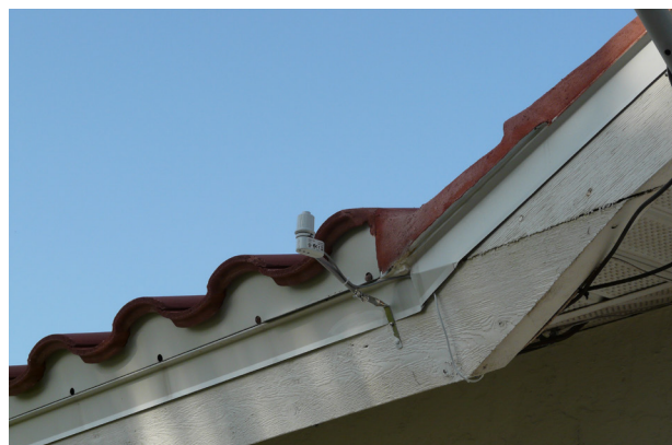
Rain sensor obstructed by roof line (top) should be repositioned (bottom).