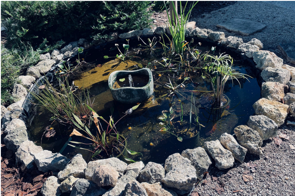
Final stage of the pond renovation