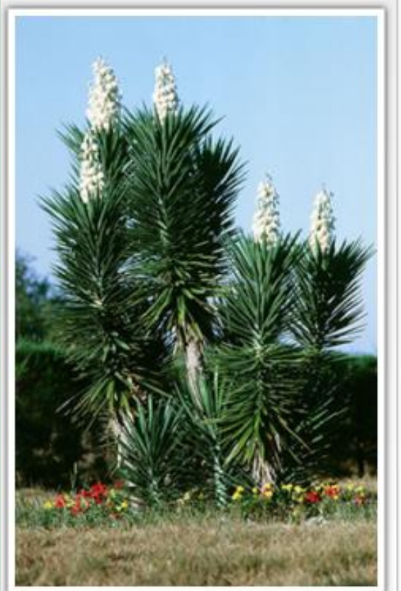
Spanish bayonet ( Yucca aloifolia ) in Sanibel, Florida.