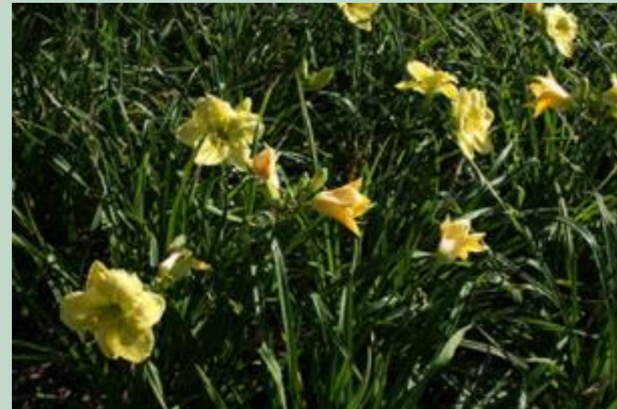
IFAS Gardening Solutions

https://gardeningsolutions.ifas.ufl.edu/plants/ornamentals/daylilies.htm