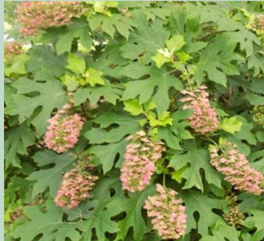
Missouri Botanical Gardens Plant Finder

https://gardeningsolutions.ifas.ufl.edu/plants/ornamentals/oakleaf-hydrangea.html